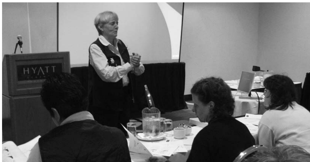
A workshop at the 2003 FNSA Conference

Overall the evaluation results were very positive, with a majority of the people interviewed indicating that FNESC is responsive to the direction of First Nations, and that the organization provides an important forum for a united First Nations voice on education matters. The evaluation report states that FNESC, through its Board of Directors, management structures, and staff, fulfills the mandate it was originally provided; FNESC is seen to communicate effectively, seek and respond to community direction, and employ skilled and motivated staff. In addition, the evaluators agreed that FNESC maintains effective financial management, including efficient budget management and low overhead costs for program implementation. Other specific FNESC evaluation results are outlined on the following pages.