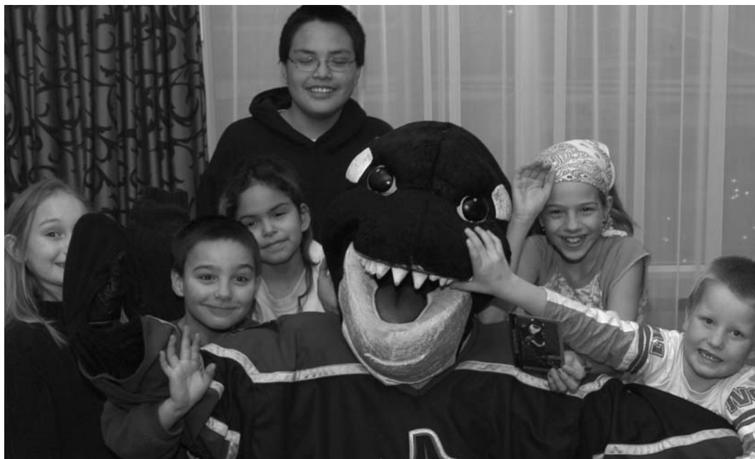
Seventh Generation Club Attendance Achievement Program

Throughout its five-year existence, the majority of funding provided through the Gathering Strength program was distributed directly to First Nations schools and communities for locally-based activities, and that practice was continued through the New Paths for Education initiative. In 2003/2004, $2.5 million was distributed to First Nations schools through a base-plus-per-capita funding formula. Schools used those grants for projects related to school capacity building, stay-in-school efforts, special education, literacy programming, and service integration. Approximately $2.4 million was also provided to First Nations communities through a base-plus-per-capita formula for education initiatives.