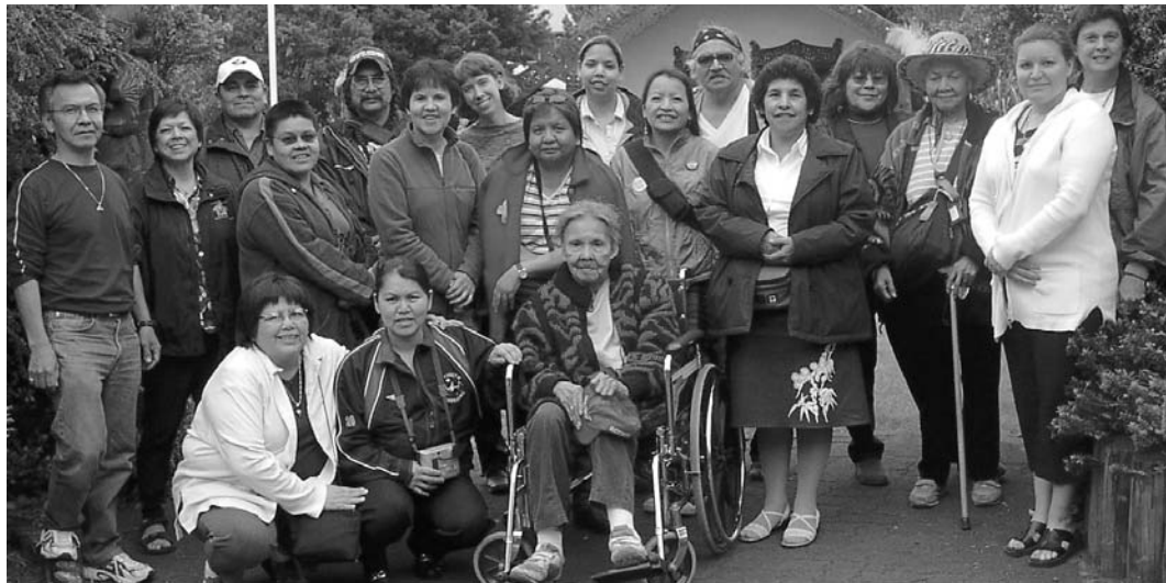
New Zealand Trip Participants

In partnership with the BC First Nations SchoolNet program, in 2003 the Aboriginal Languages Subcommittee developed the first of what is intended to be a series of handbooks to assist language teachers and curriculum developers in effectively using technology to prepare language resources. The first handbook, Recording Your Language , includes suggestions for recording and preserving the words of Elders. Over 400 copies of that handbook have been distributed since its publication.