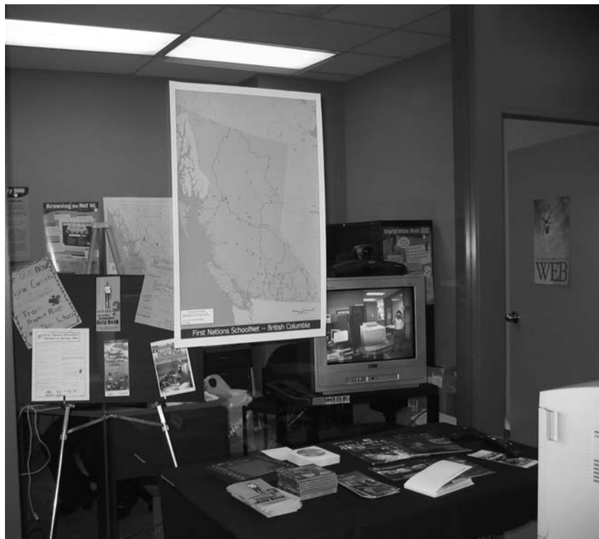
FNESC 2003 Open House

There was also strong agreement that FNESC fairly and legitimately speaks on behalf of and as directed by BC First Nations. All FNESC Board members, First Nations school representatives, and affiliated board members agreed that FNESC provides a united voice on education issues. 94% of First Nations, 75% of School District, 87% of federal and provincial government, and 67% of First Nations political organization representatives also shared that perspective.