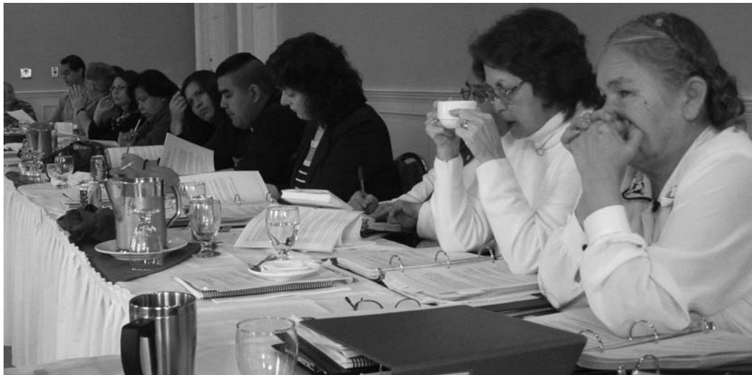
FNEESC Board Meeting April 2003