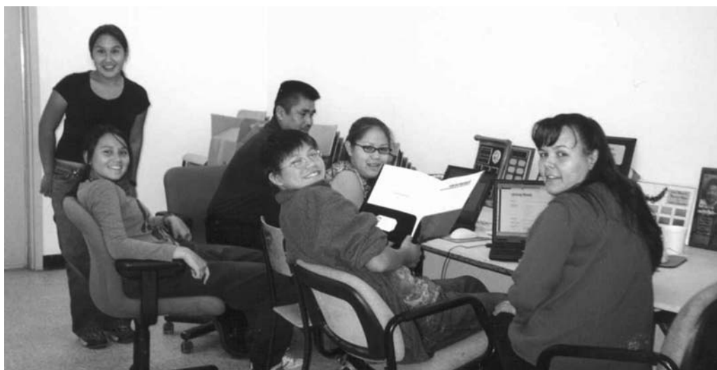
Nee Tahi Buyn Secondary School Career Placement Program

For the creation of Community Education Authorities, interested First Nations will formally indicate their interest in negotiating an agreement to have their jurisdiction over education acknowledged. This formal "opting in" may require a Band Council Resolution (BCR). The First Nation and the federal government will then confirm their commitment to the framework for jurisdiction (the MoU), and negotiations will begin. The negotiations will include consideration of the cost of providing a quality education under First Nations jurisdiction, as well as the creation of an appropriate implementation plan and accompanying