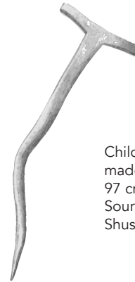
Chilcotin digging stick made of caribou antler. 97 cm long. Source: James Teit, The Shuswap , page 513

Once the roots and bulbs have been exposed, the harvester can then pick those that are the best size for harvesting. The sod can then be put back in place, and the remaining plants can continue to grow. This ensures the plants are harvested sustainably.