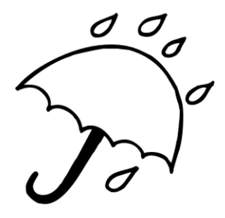
g. Do you need an umbrella today?