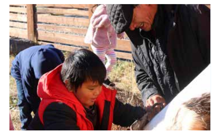
Sxoxomic Community School

registrants (approx) attended the three drop-in information sessions