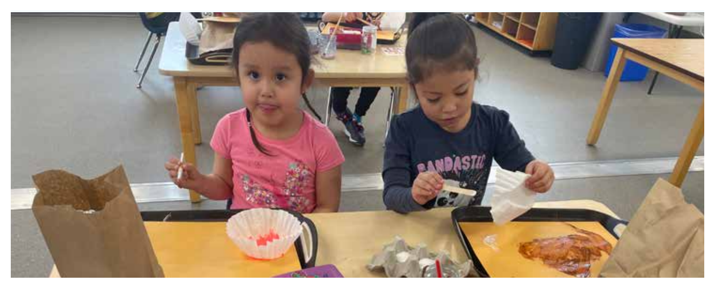
Okanagan Indian Band Cultural Immersion School