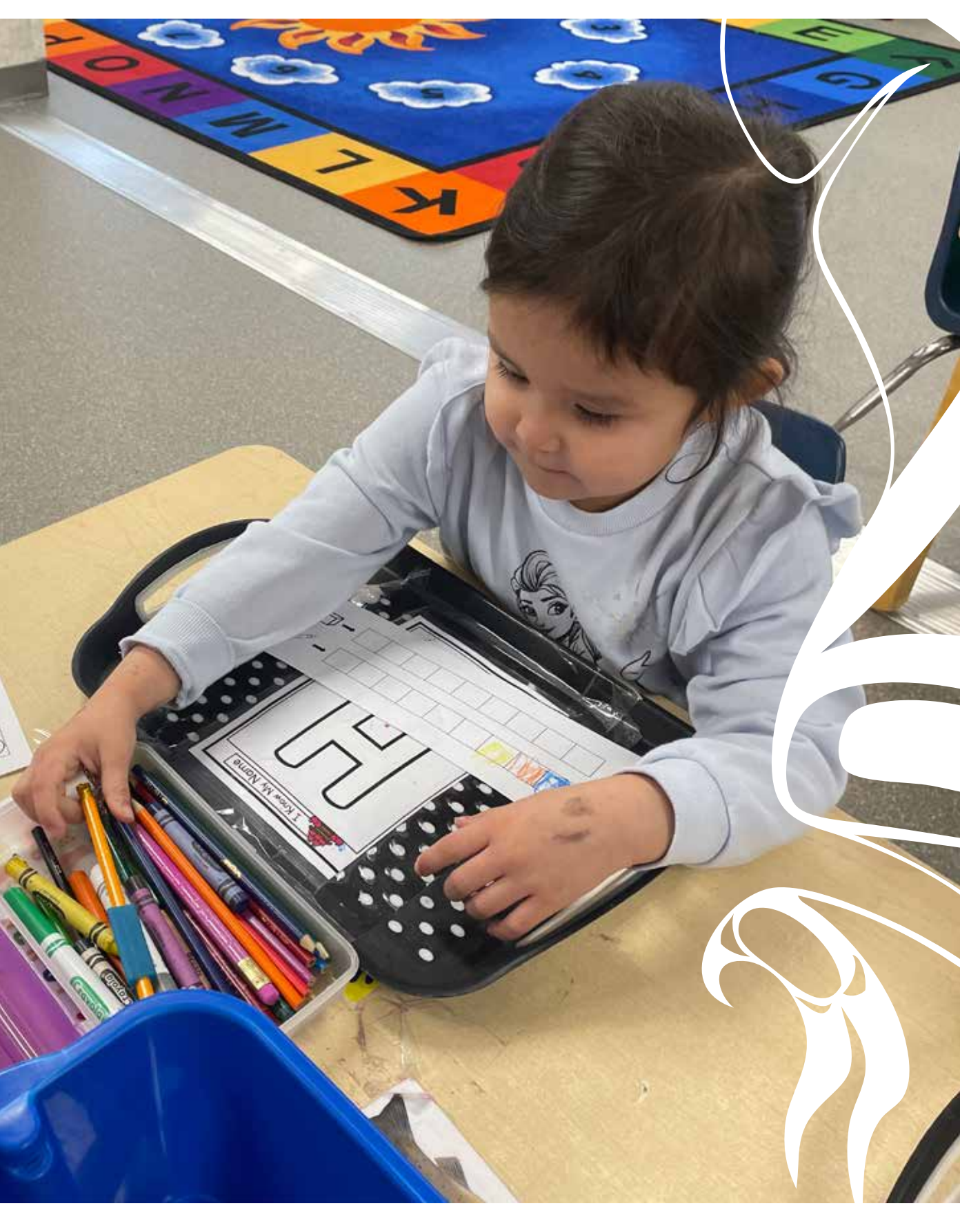
Okanagan Indian Band Cultural Immersion School