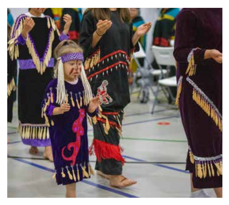
Jurisdiction Celebration at Seabird Island

partnership with a consortium of IAHLA institutes and public post-secondary institutions, FNESC and IAHLA have continued to advance a framework for a four-year Indigenous Language Fluency Degree that has fluency in an Indigenous language as its primary learning outcome and purpose. In 2022/23, FNESC and IAHLA allocated funding from the Ministry of Post-Secondary Education and Future Skills, which built on previous investments and provided an additional $1.7 million to six First Nations and First Nations-mandated institutes that are developing degree programs aligned with the framework. Funding is available