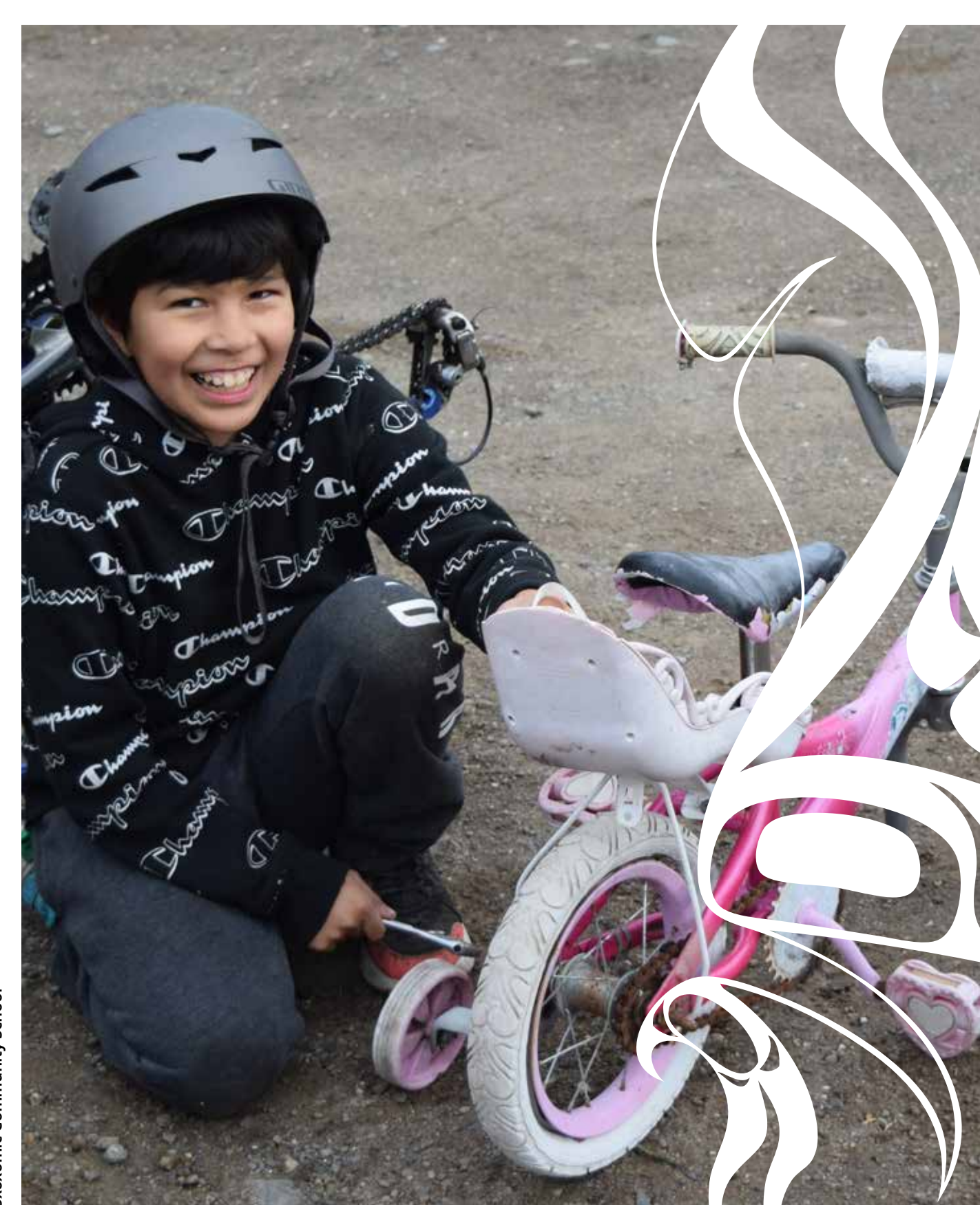
Sxoxomic Community School