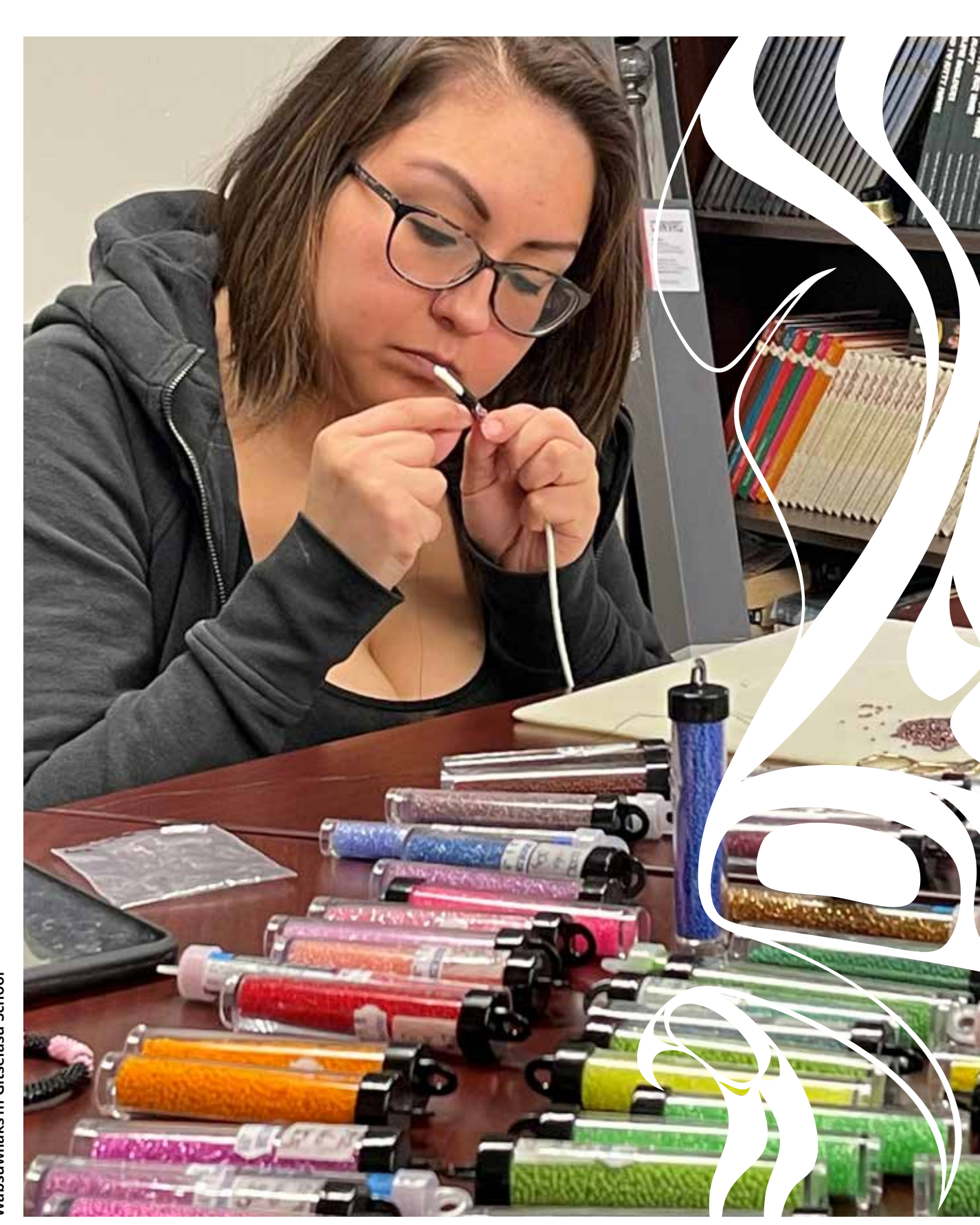
Wabsuwilaks'm Gitselasu School