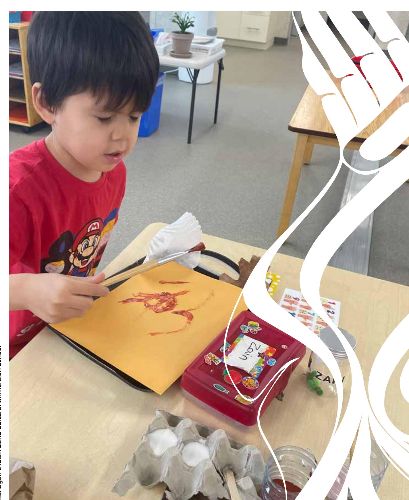
Okanagan Indian Band Cultural Immersion School