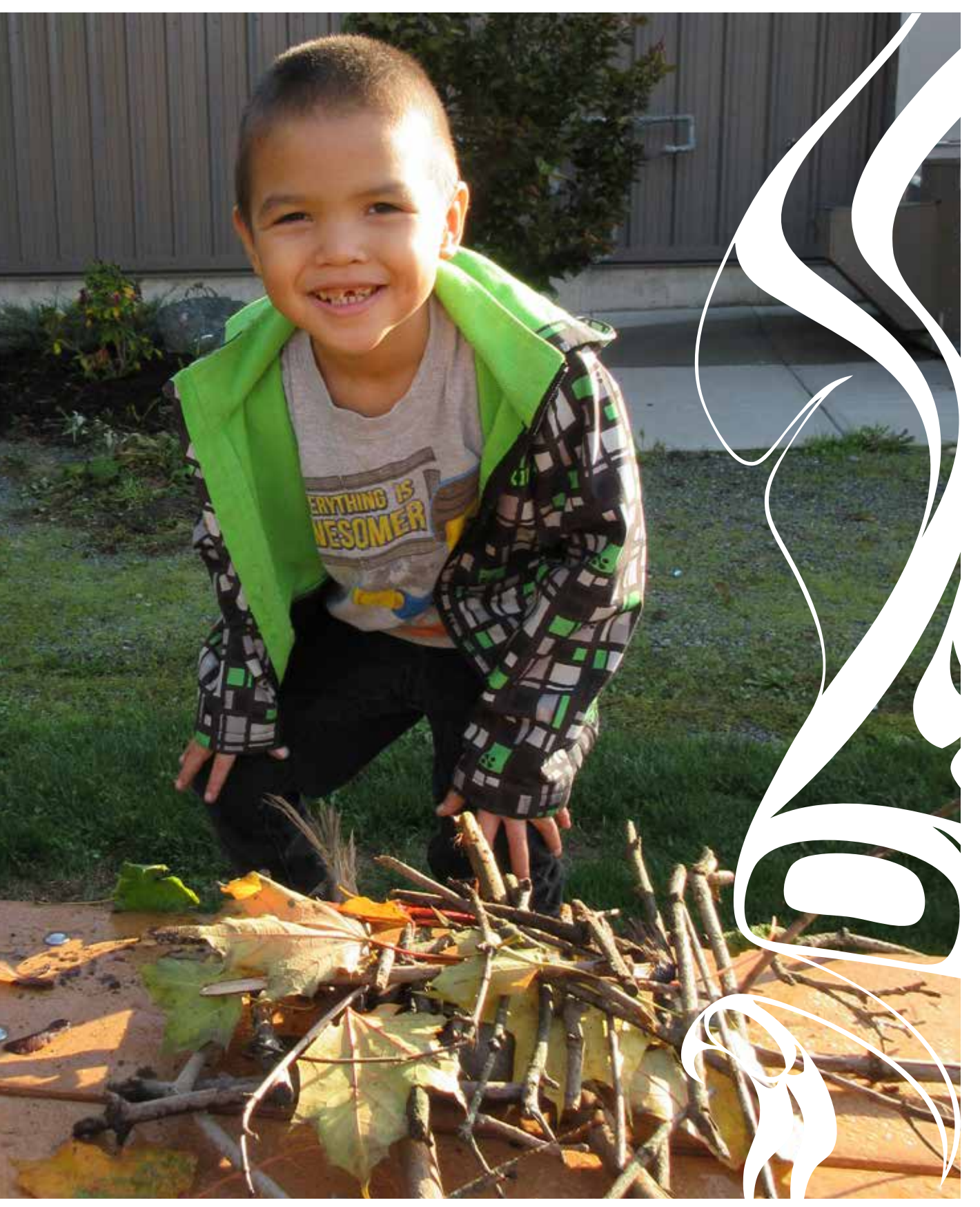
Chilliwack Landing Preschool and Kindergarten