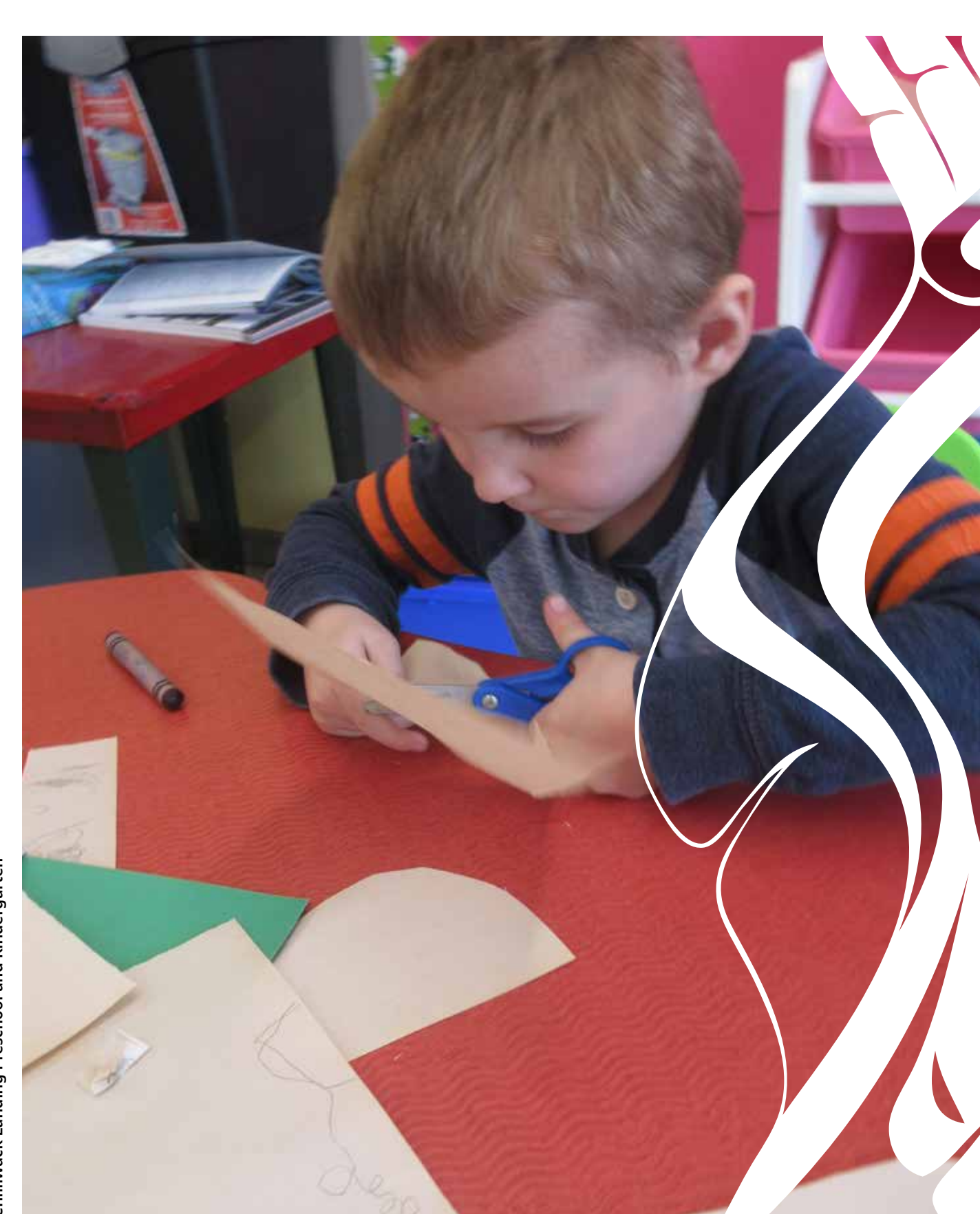
Chilliwack Landing Preschool and Kindergarten