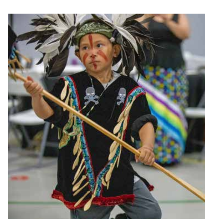
Jurisdiction Celebration at Seabird Island

representatives joined one of five regional workshops designed to facilitate discussion about the development and implementation of effective IEPs for students who have exceptionalities