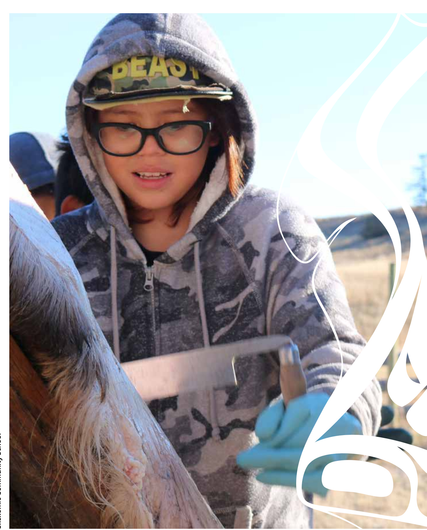
Sxoxomic Community School