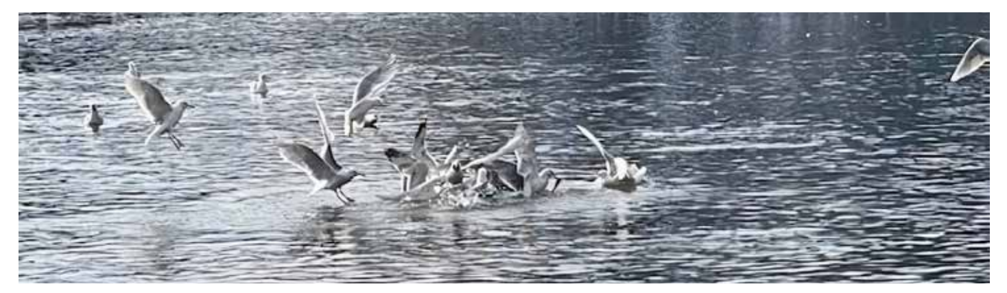
Wabsuwilaks'm Gitselasu School